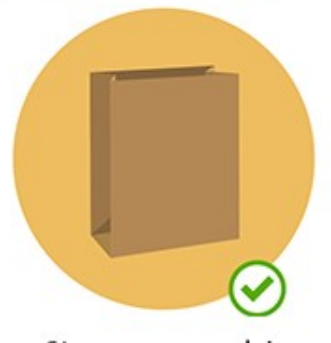
Store your mask in a clean paper bag.