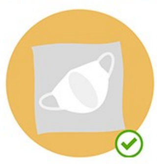
Place your mask on a clean paper towel. (Exterior of the mask facing down with the ties placed away from the inside.)

How to store your mask when going to the bathroom, taking a drink or eating.