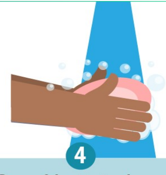
Be careful not to touch your eyes, nose, and mouth when removing and wash hands immediately after removing

How to store your mask when going to the bathroom, taking a drink or eating.