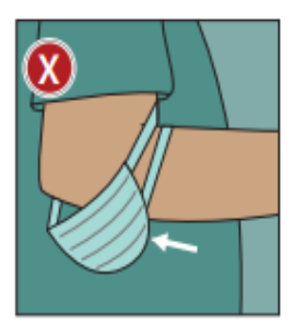
Don't hang off your arm or hand.